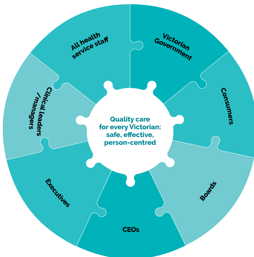
Figure 1: Clinical governance roles

In addition to these responsibilities, every member of a health service (clinical and non-clinical alike; see Figure 1) has specific responsibilities regarding achieving and maintaining high-quality and safe care.